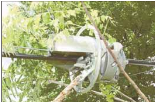
Lasher Guard "Halo"

B: An optional overlap handle (P/N 28120) is available which can be placed on the front of the machine without any interference of the opening when overlashing.