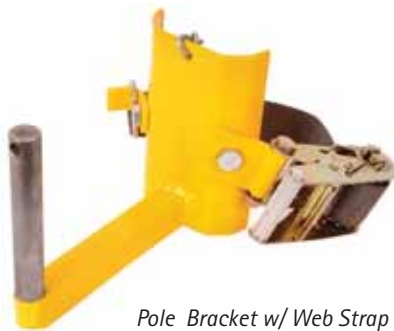
Pole Bracket w/ Web Strap

This VATS Guide (70374) is designed to be used as either an in-feed guide, utilizing the Strand Bracket (70373), or as a corner guide when attached to the Pole Bracket (70372). With a 4-1/2 in. (114 mm) wide opening, it's your first choice for placing the new Multi-Port Terminal Fiber.