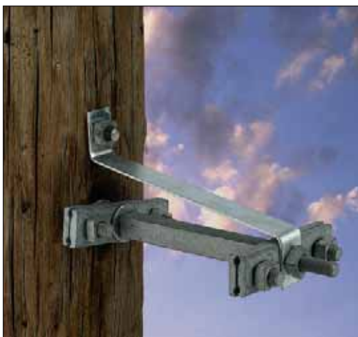
Extra long combination