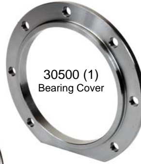
30500 (1) Bearing Cover