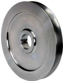
30510 (1) Sheave