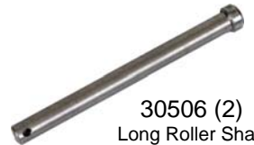
30506 (2) Long Roller Shaft