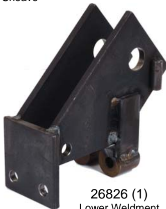
26826 (1) Lower Weldment