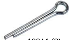
16811 (2) Cotter Pin