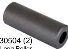
30504 (2) Long Roller (2) 26669 Bushings Req.