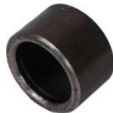
26450 (1) Sheave Bushing