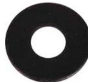
16583 (2) Washer