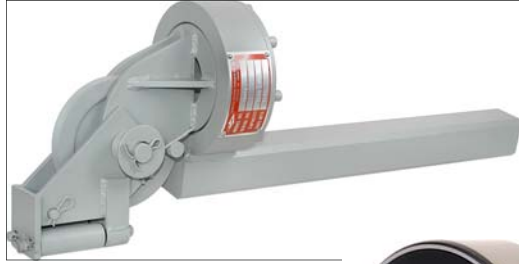
26828 (1) Housing/Tongue Weldment