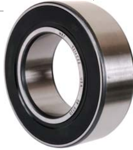
26706 (1) Bearing