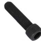
30560 (7) Screw