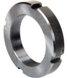
30508 (1) Nut