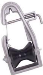
10701 Cable Block with Rubber Roller

This economical block has a Alumi- num roller & is used for new strand & over lash work