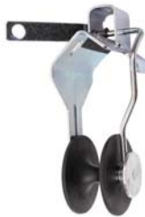
70336 B Overlash Block

This block lets you over-lash to cable bundles up to 2 in. (50 mm) across ... and its affordability lets you use more blocks for smoother, neater lashing on new or rebuild construction.