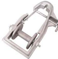
10700 Cable Block with Aluminum Roller

This tempered spring steel block is used to support cable up to 1" (2.54 cm) dur- ing cable pullout.