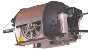
Apollo Cable Lasher Parallel-pull capability up to 4" bundle