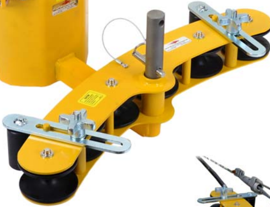
70438 90° Corner Block