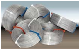
Stainless Lashing Wire Highest quality lashing wire that's guaranteed to work with our lashers.