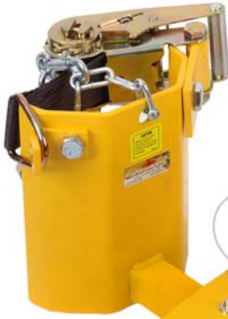
70439 45° Corner Block