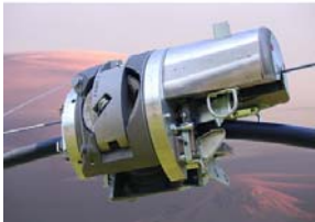
J2 Cable Lasher Time tested workhorse for up to 3" bundle

Visit www.GMPtools.com for the Tools to help you “get the job done right”