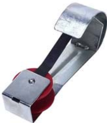
87265 Clip-On Block

This block lets you over-lash to cable bundles up to 2 in. (50 mm) across ... and its affordability lets you use more blocks for smoother, neater lashing on new or rebuild construction.