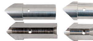
CABLE GUIDE KIT