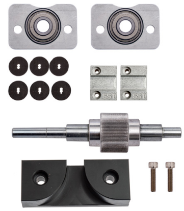
Cable Seal Collet Assemblies

When choosing the Plus Model: Receive all components to blow the 3 most popular sizes