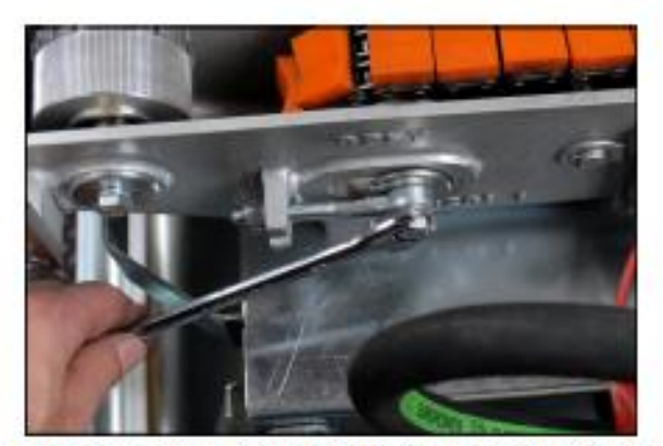
Remove the swing bolt from the side of unit using a 13mm wrench.

3. Unscrew the main clamping screw and separate the top and the bottom of the pusher unit. Place in a safe location.