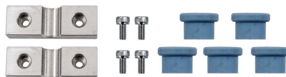
Tube Clamps and Seals