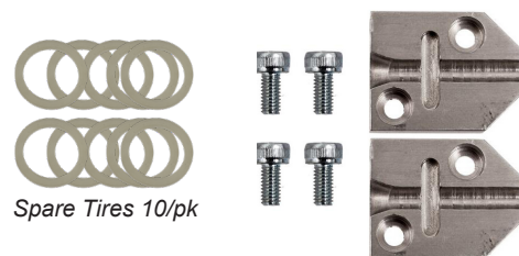
Spare Tires 10/pk