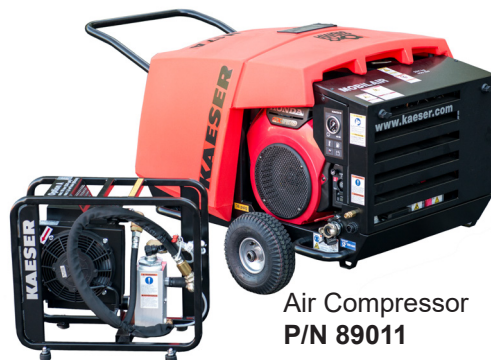
Air Compressor P/N 89011

Receive all components to blow the 3 most popular sizes