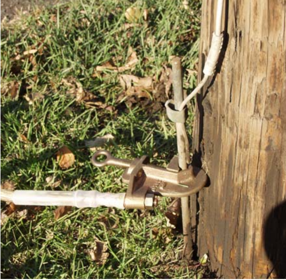
Vertical neutral of a multi-grounded neutral system

A satisfactory power company vertical neutral of a multi-grounded neutral (MGN) system ground or existing grounded communication plant that is bonded to a central office ground or underground metallic piping system must be present to properly use grounding kit when placing strand under the following conditions: