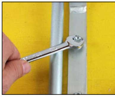
STEP 5 Install frame assembly and fasten with lock washers, nuts and tighten to 50 inch pounds.

STEP 4 Turn seat over and place back on wood blocks. Install bracket and latch assembly. Fasten with lock washers, nuts and tighten to 50 inch pounds.