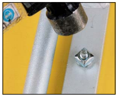
STEP 6 Round over threads with a ball peen hammer on all bolts to prevent the nuts from backing off during use.