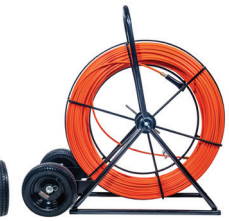
3/8 IN DUCT RODDER