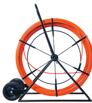
1/2 IN DUCT RODDER