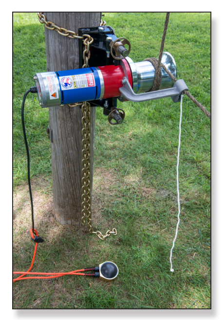
Typical hoist setup