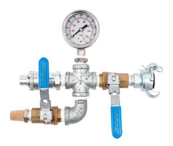
P/N 89643 Pressure Valve Assembly

Create your own kit, using the components below and the Carry Case