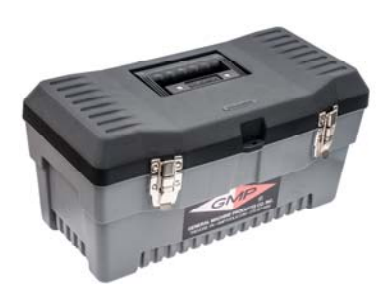
P/N 89820 Carry Case