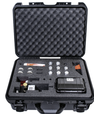
Supplied with a durable waterproof crushproof case