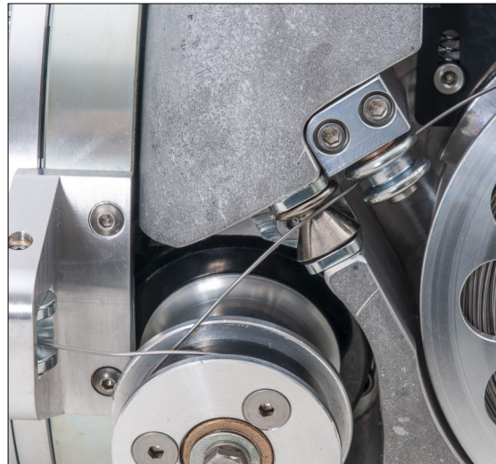
WIRE ROUTING RIGHT SIDE